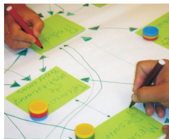
(ii) Placement of influence towers and drawing of 'smiley' faces to indicate stakeholder attitude to the project

Day 3: Developing the outcomes logic model and an M&E plan In the final part of the workshop, participants distil and integrate their cause-effect descriptions from the problem tree with the network view of project impact pathways into an outcomes logic model . This model describes in table format (see Table 1) how stakeholders (i.e. next users, end users, politically-important actors and project implementers) should act differently if the project is to achieve its vision. Each row describes changes in a particular actor's knowledge,