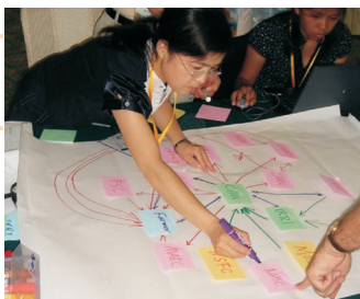
(i) Drawing a network map